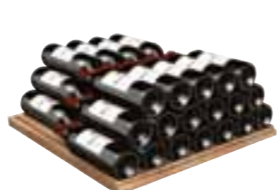
storage shelves up to 77 bottles