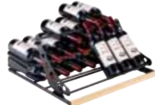
display shelves up to 32 bottles

The space between the shelves is designed to protect your bottle labels, especially those of Champagne bottles.