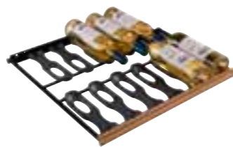
Sliding shelves up to 12 bottles