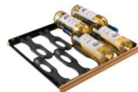
Slidign shelf ACMSC

Flush fitting multi-temperatures wine cabinet Premium Pack