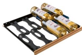
Sliding shelf ACMSC

Ageing 1 temperature wine cabinet Premium Pack