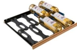
Sliding shelf ACMSC

Flush fitting wine cabinet Multi-temperatures Premium pack